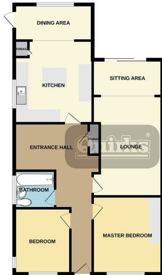
TOTAL FLOOR AREA : 893 sq.ft. (82.9 sq.m.) approx.

This floor plan is for illustrative purposes only. All representations including measurements, doors, windows and fixtures are approximate and NOT TO SCALE. The total floor area includes all floor space associated with the property including garages and outbuildings as depicted. No appliances or services are confirmed as included or tested. Made with Metropix 62026